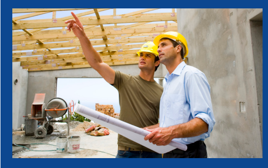
FINISHING WORKS It's easy to manage finishing works such as plumbing or electricity thanks to the numerous customised business settings.

For each activity, Proginov provides the best solution for your needs through continuous dialogue with our staff and business project managers.