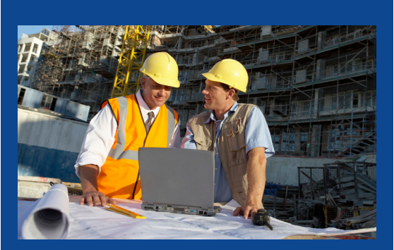
STRUCTURAL WORKS The Proginov ERP system lets you monitor and control your construction sites in real time to optimise your costs and margins in the short, medium and long term.

The Proginov ERP system is a comprehensive management software suite for construction professionals.